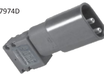
3 Pole Portable Receptacle Kit