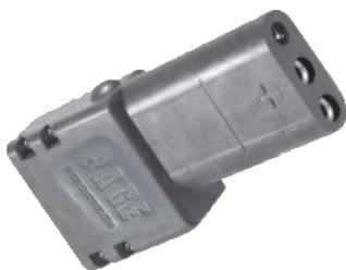
3 Pole Plug Kit

Molded of Hypalon, they have excellent abrasion and chemical resistance. Power contacts are silver plated copper with a minimum of 90% IACS conductivity.