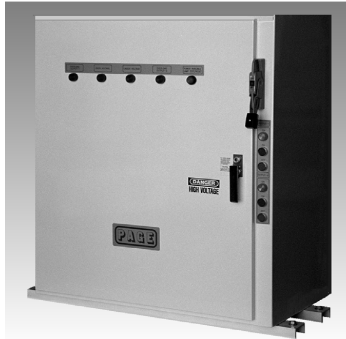
Dual Output Gate Box, with optional On/Off controls