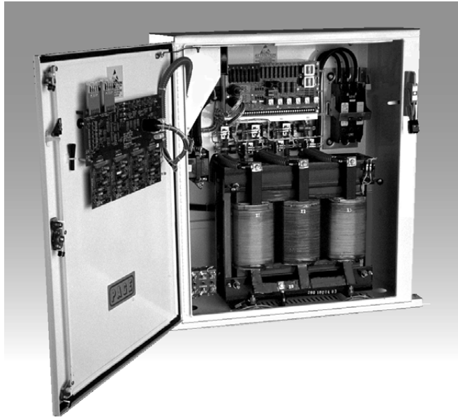
Dual Output Gate Box